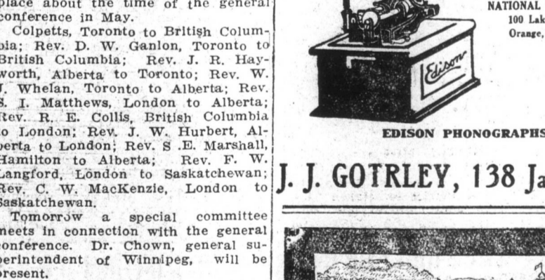
Showing Wonderful Growth Since 1888