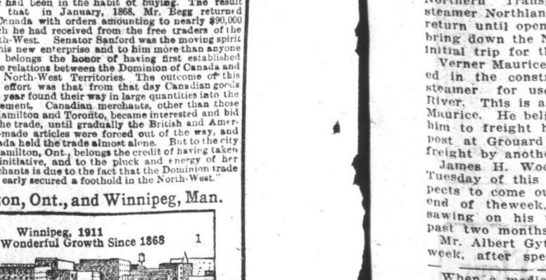
Showing Wonderful Growth Since 1888