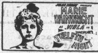
AT THE GRAND TO-NIGHT.

Washington, Nov. 2.—The President yesterday issued the Thanksgiving Day proclamation, setting aside Thursday, Nov. 24, "to be observed as a day of festival and thanksgiving by all the people of the United States, at home and abroad."