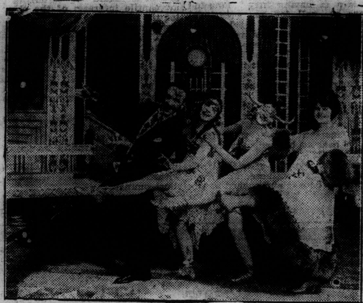
A Dance from "The Golden Call" scene in "FLORA BELLA," Grand Opera House, Tuesday, September 25.