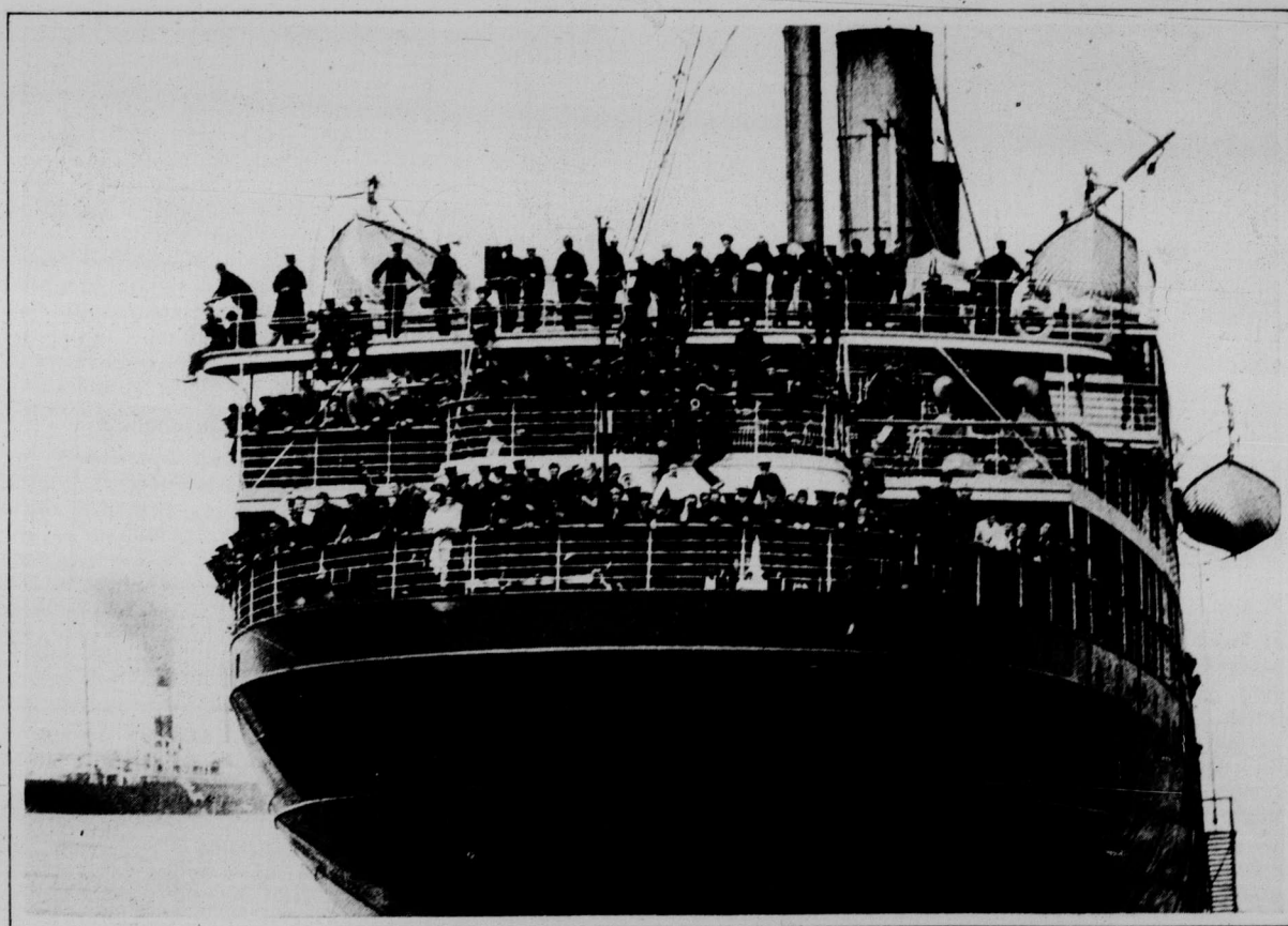
The Fanconia carried 1,200 Canadian troops; a military democracy all travelling first-class