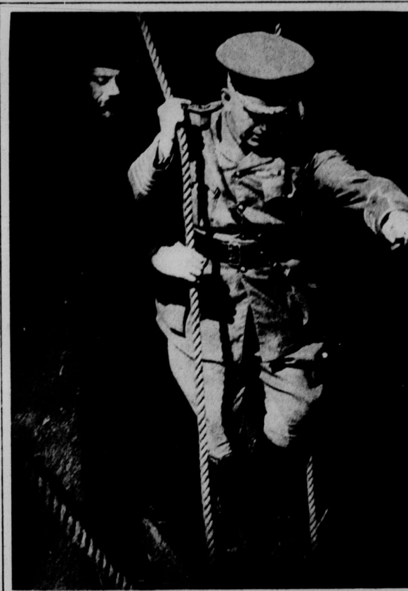
Major-General Sam Hughes coming down the gang-plank