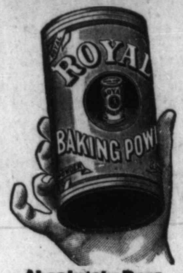
Absolutely Pure THERE IS NO SUBSTITUTE