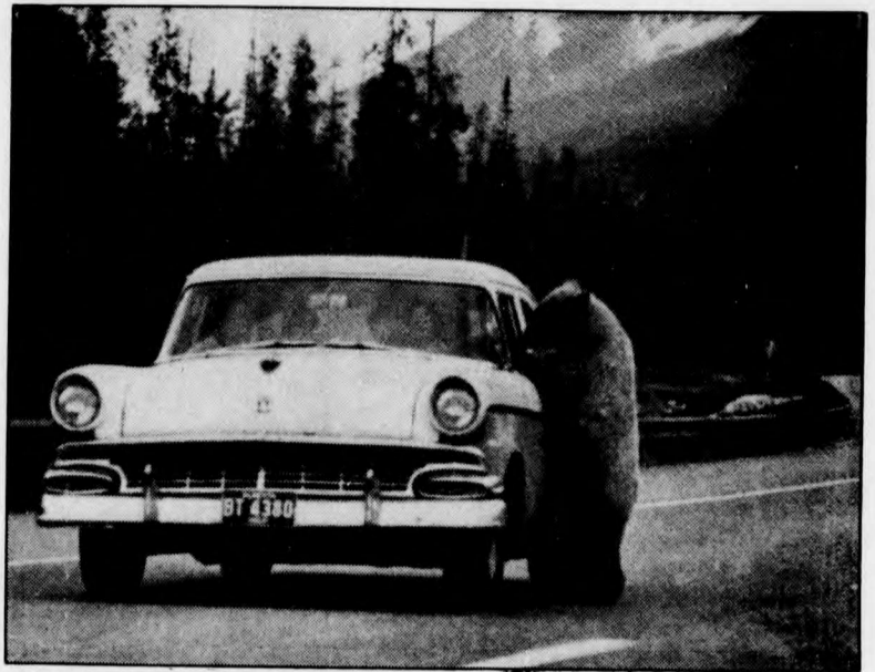
On the campaign trail... The bear was out getting the "frightened tourist" vote, or at least something to tide her over until lunchtime.

The bear's answer was more on topic. "People are more interested in a candidate's image than her platform. It's a sad comment on the electoral process, don't you think? But, there you are: electoral success depends upon how well you disseminate your image. I believe it was Machiavelli who first wrote — ooh! Excuse me, but I have to go steal food out of that camper's picnic basket!" Manitoulin, who, by default, has become the administration's