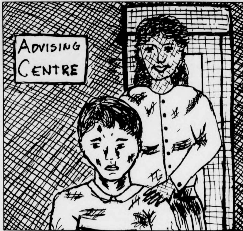
ADVISING NETWORK: Helping the frosh face York.