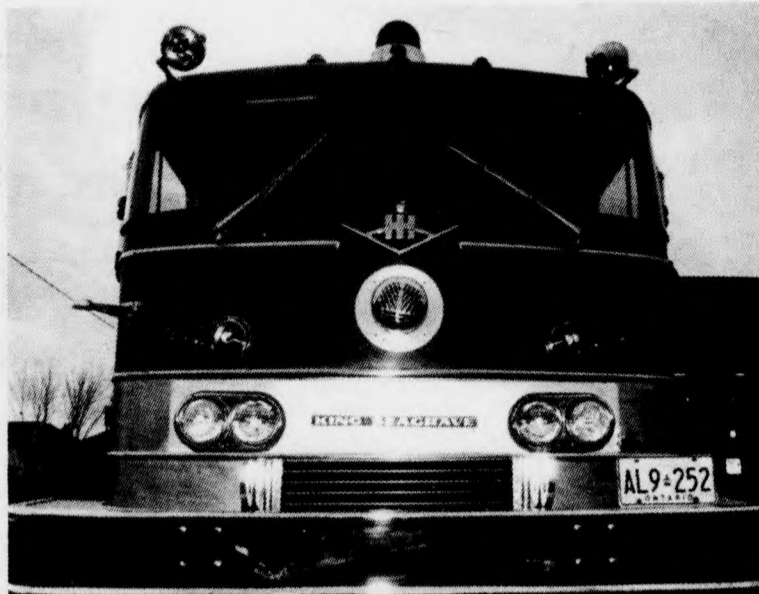
MAXIMUM OVERDRIVE II: Stephen King, under the capable hands of Dino King Kong Lives De Laurentis , is once again on the rampage. Only this time it's the fire trucks that get even.