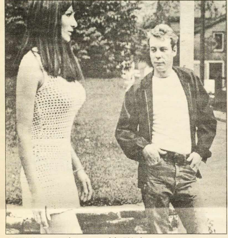
DAZZLING: East coast boys awestruck by TO's skyscrapers.

ROLLED INFLUENCES: Big Wreck debut CD worth remembering.