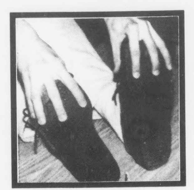
Beefle Ed "Oragami"