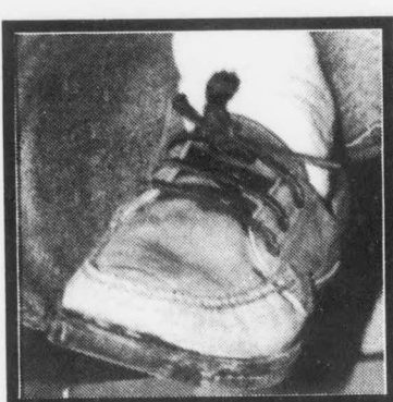
Jeff Cummings B.E. Eng. 1 "Toilet Paper."