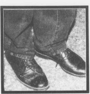
Dwayne Moore Nothing "Pinata"

Question: If 1000 Brunswickans are delivered to Head Hall every Friday and no one reads them where do they go?