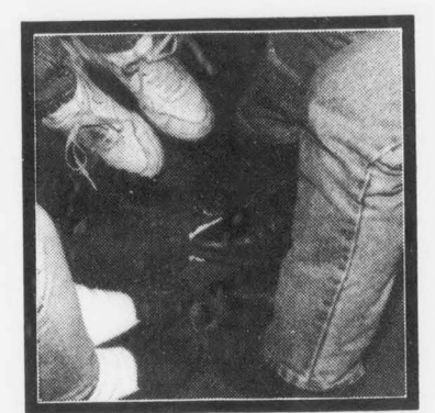
"The Cosmo-Naughts" "They are used to reeducate the failing engineers(get a life heads!)."