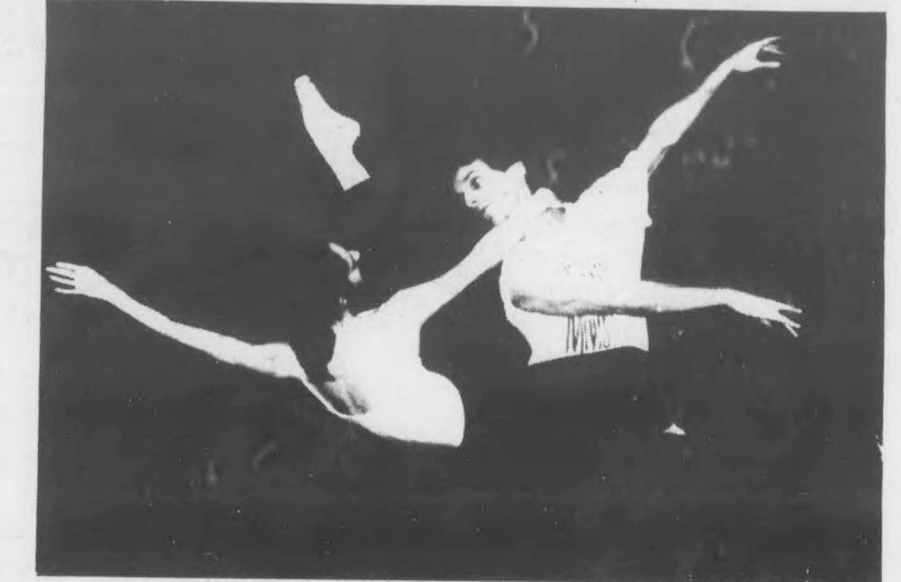
Ballet British Columbia: A unique expression of life through dance.

Professionally trained and experienced counsellors are available day and night to the students of UNB and STU. All regular and part-time students can get free and confidential help.