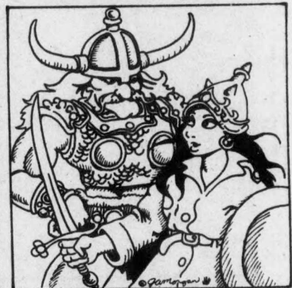
NOT ONLY IS IT A +2 OVERCOAT BUT IT PROTECTS ME FROM BECOMING CHEESECAKE.