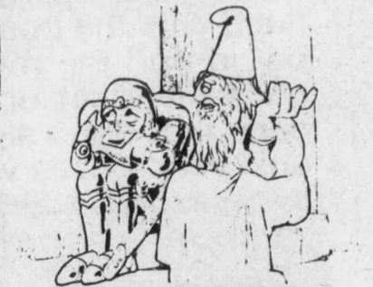
DON'T LET IT BOTHER YOU. LOTS OF FIGHTERS HAVE SWORDS THAT ARE SMARTER THAN THEY ARE.