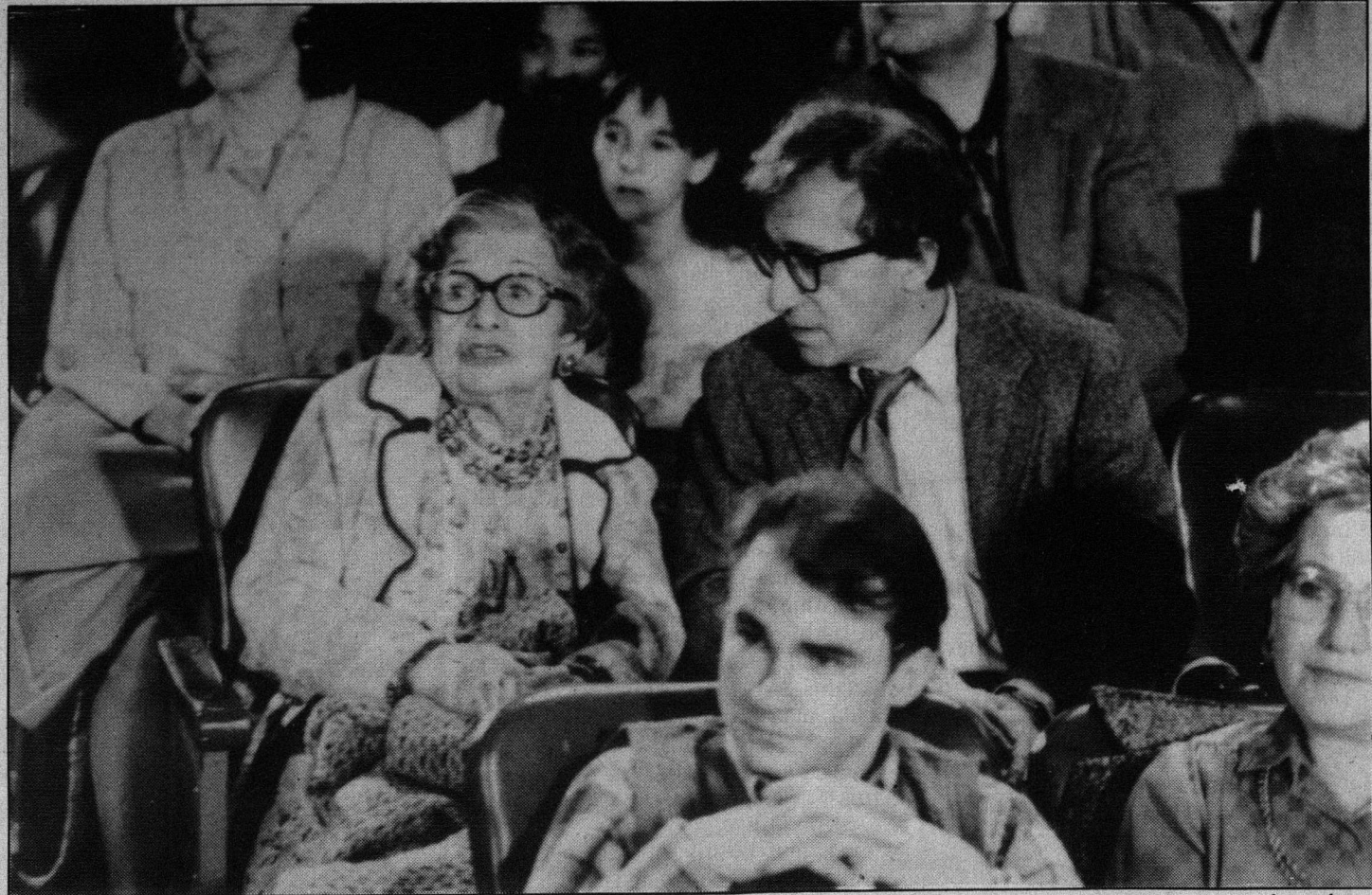
Woody Allen and his onscreen mother Mae Questel steal the show in New York Stories , a film which feature short segments from three well-known directors.

The second film, "Life without Zoe," can be considered the low point in the movie. While the others manage to portray bits of life in New York, Francis Coppola gives us the fantasy life of a 12-year-old which any child would dream of. Zoe has a world renowned flautist for a father, and