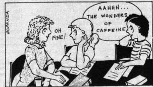
Once Upon A Time