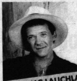
MURRAY MC LAUCHLAN