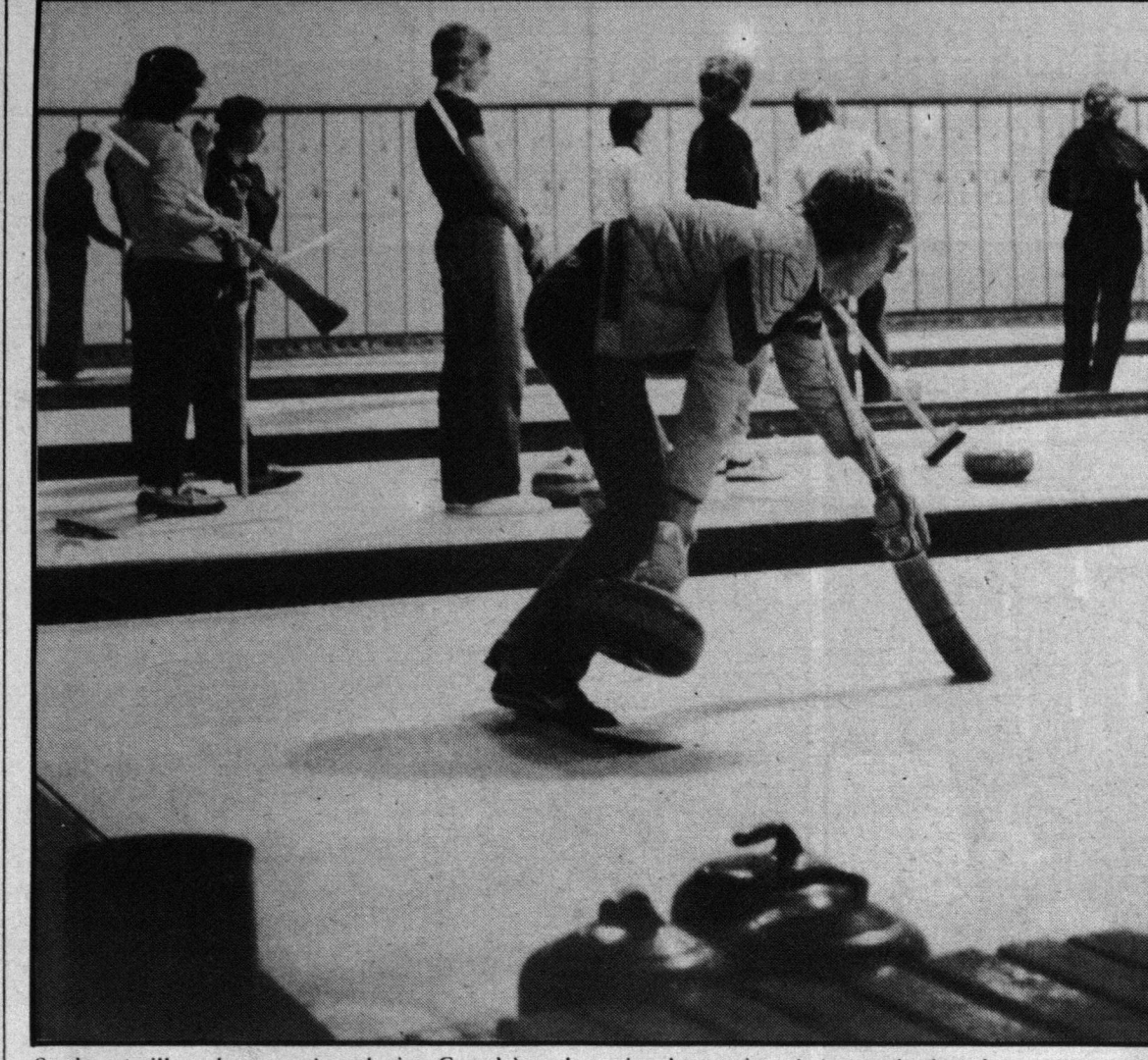
Students will no longer enjoy playing Canada's truly national sport in their own backyard.