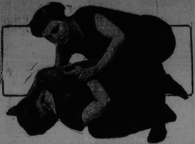
ILLUSTRATING THE HAMMERLOCK AND QUATER NELSON, WHICH BOSTON WOMEN SAY MAKE FOR GRACE AND STRENGTH.

Some Boston women advocate wrestling as a road to grace and robustness. New York women are opposed to the sport and if Gotham's physical culturists can prevent it, its women will not trail the Hub's daughters.