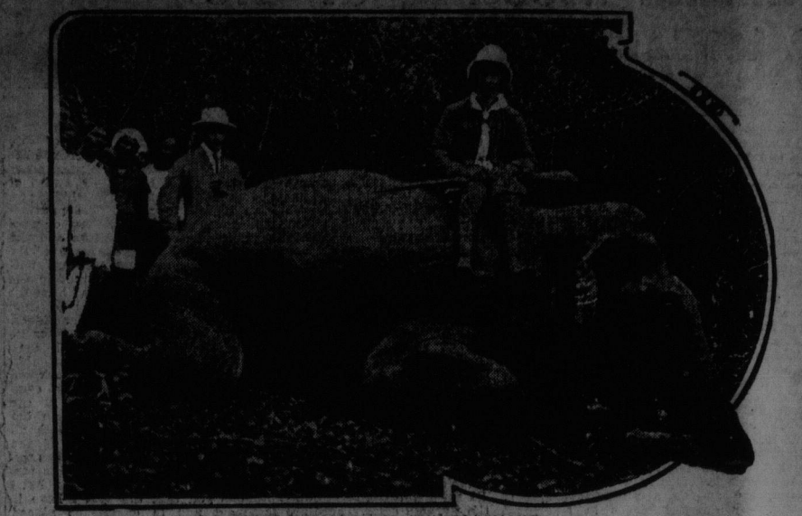
FREDERICK WILLIAM AND THE ELEPHANT.

The Crown Prince of Germany has achieved the hunter's supreme desire. He has killed his first elephant. It happened the other day in India where he is on a big hunting trip and he was so proud he sat on the elephant for a photograph.