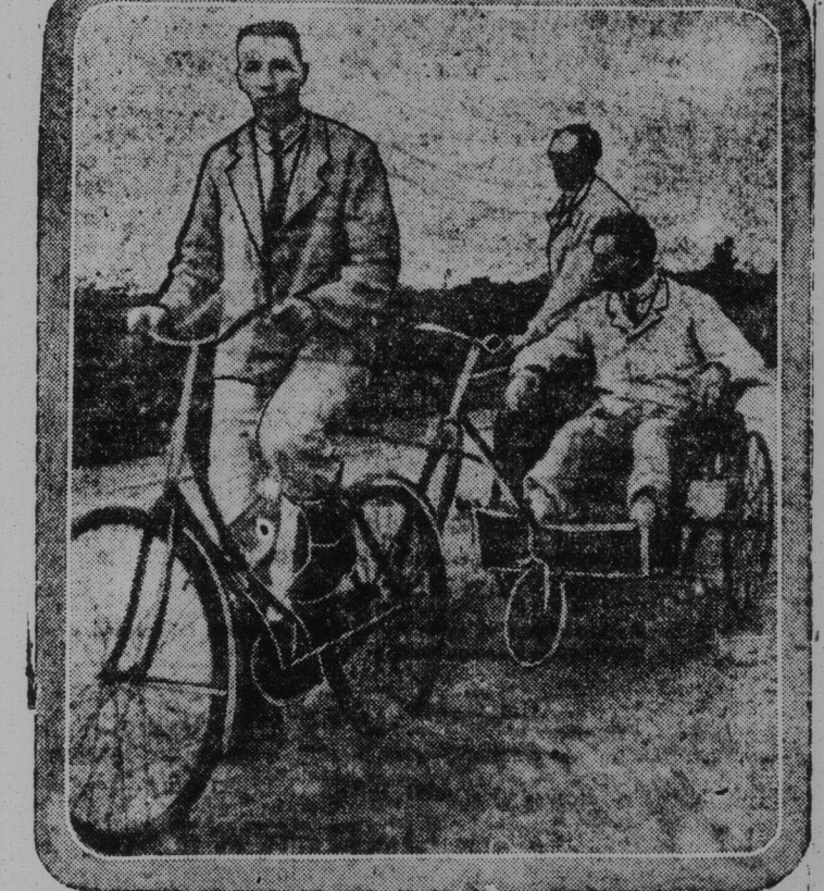
British Tommies wounded in the "Big Push" on the Somme are shown in the picture enjoying themselves on push bicycles while convalescing in England