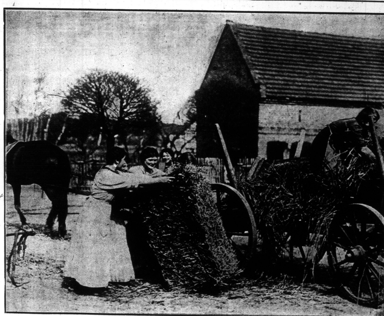
A scene on a big farm for homeless women. Berlin, Germany, has just dedicated a large and beautiful farm on the outskirts of the city, where the homeless and friendless women and children of the city are made at home. The latch string at the farm gate is not tied up with the many knots of red tape usually found at an institution of this kind. The photo shows some of the inmates loading the farm wagon with baled hay preparatory to sending it to market.