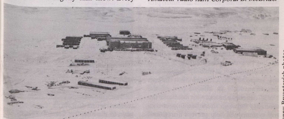
Aerial view of Alert, situated at least 900 kilometres from the North Pole.