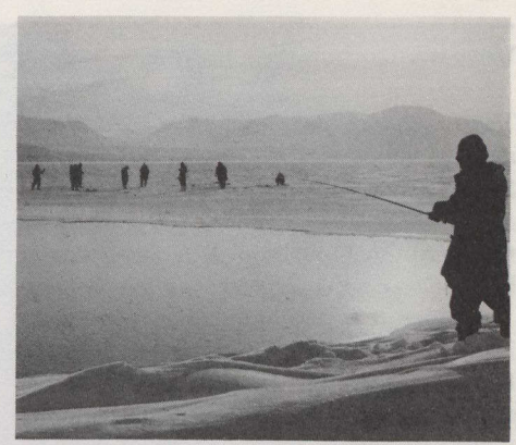
Fishing is a favourite pastime.

period of complete darkness) lasts from October 12 to March 3. (A period of complete daylight extends from April 8 to September 5.)