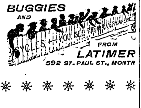
ALL KINDS OF Carriages, Farm Implements and Bicycles.