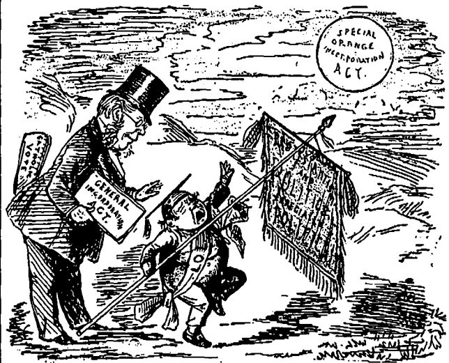
BEYOND HIS REACH. The little Orange boy still crying for the moon!