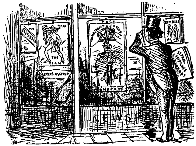
THE VICTIMIZED REPUBLIC! PASSER-BY.—(studying cartoon of the Gould-Vanderbilt telegraph monopoly)—“I don't see how those Americans tolerate such outrages!”