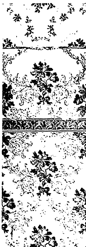
No. 770 The Watson-Foster Company.

No. 770 has proved itself one of the most successful patterns of the season. The