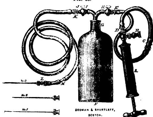
GODMAN & SHURTLEFF, BOSTON.