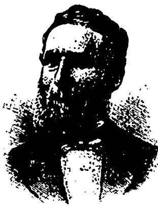
Hon. Alex. McKenzie, M. P., ex-Premier of Canada, President.

THE North American Life Assurance Co. Completed its first ten years with most gratifying results.