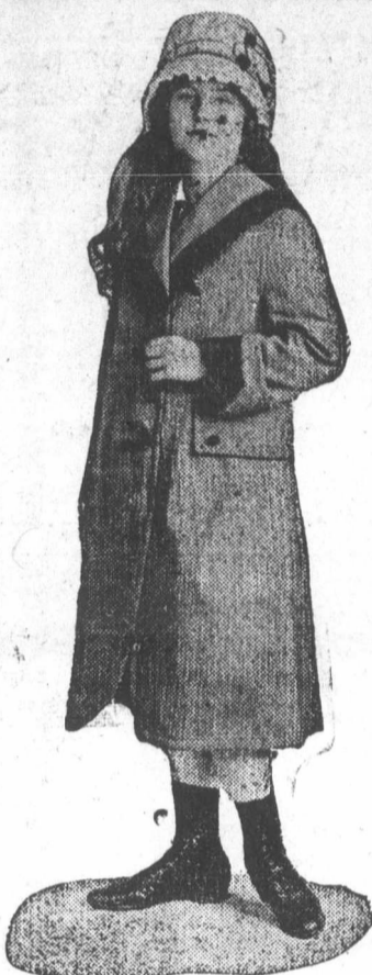
BROWN STEEL COAT.

The little coat pictured here is suitable for the small girl's school wardrobe. It is one of the new models for spring. The material is self striped brown silk and wool mixture. The wide collar and deep cuffs are banded with dark brown moire. There is a very wide belt, with a very decorative application of buttons.