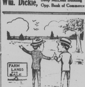
WE CAN SHOW YOU FARMS