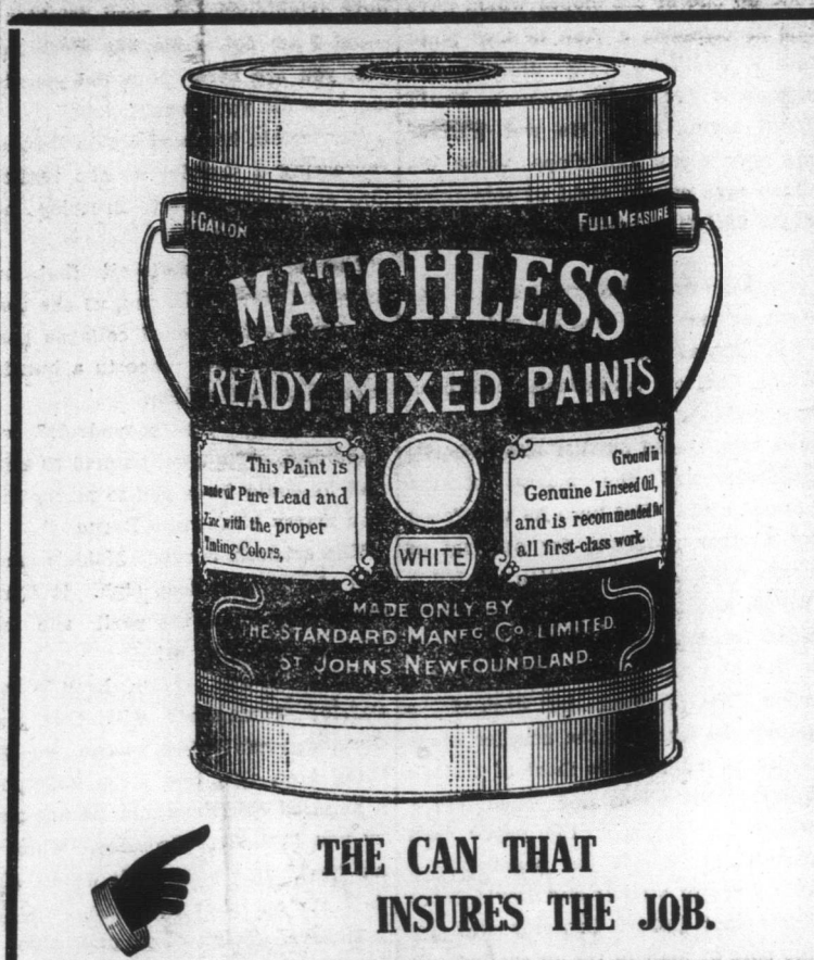
THE CAN THAT INSURES THE JOB.