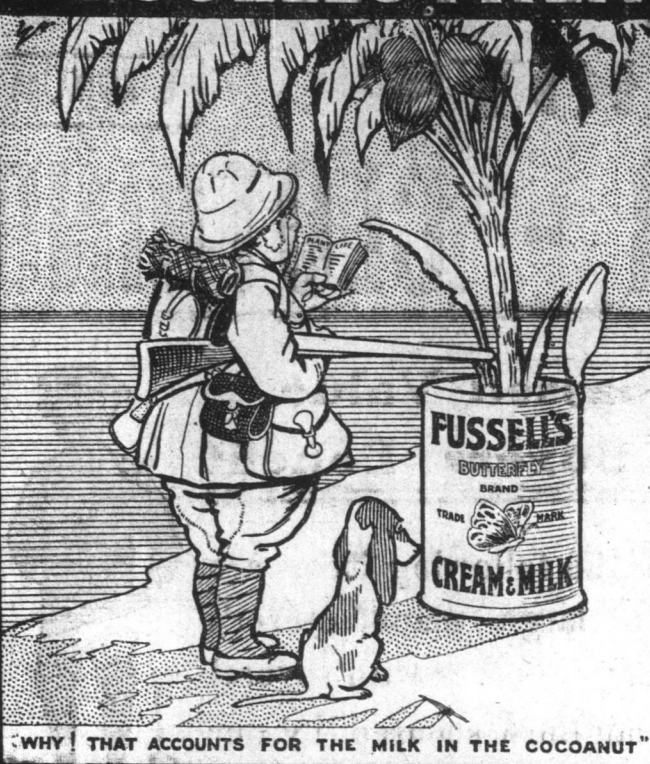
"WHY! THAT ACCOUNTS FOR THE MILK IN THE COCONUT"