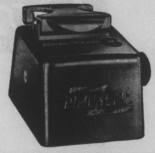
IF YOUR JOBBER CAN'T SUPPLY YOU, WRITE US DIRECT