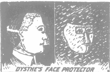
DYSHE'S FACE PROTECTOR

Let the worst storm or blizzard come as it may. The man who is wearing one of these warm Face Protectors won't feel it. You can look straight into the storm with comfort. It keeps the face warm and protects it from drifting snow. It is the greatest thing in the world for any person who may be called to face a storm. Price only $1.00. Send name and address for my catalogue.