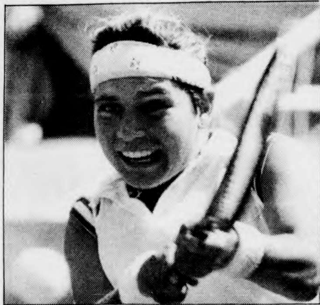
STIRRING UP A STORM: Helen Kelesi was defeated by Chris Evert in the quarter finals.

Shriver, who is better known for her doubles play with partner Martina Navratilova (who was absent at this year's Player's) hit two career milestones here in Toronto. For the first time she upset three of the world's top 10 players in succession. Gabriela Sabatini (No. 8), Chris Evert (No. 3), and Garrison (No. 7). She also passed the $3 million mark in career earnings. Shriver felt the Canadian Open title was the