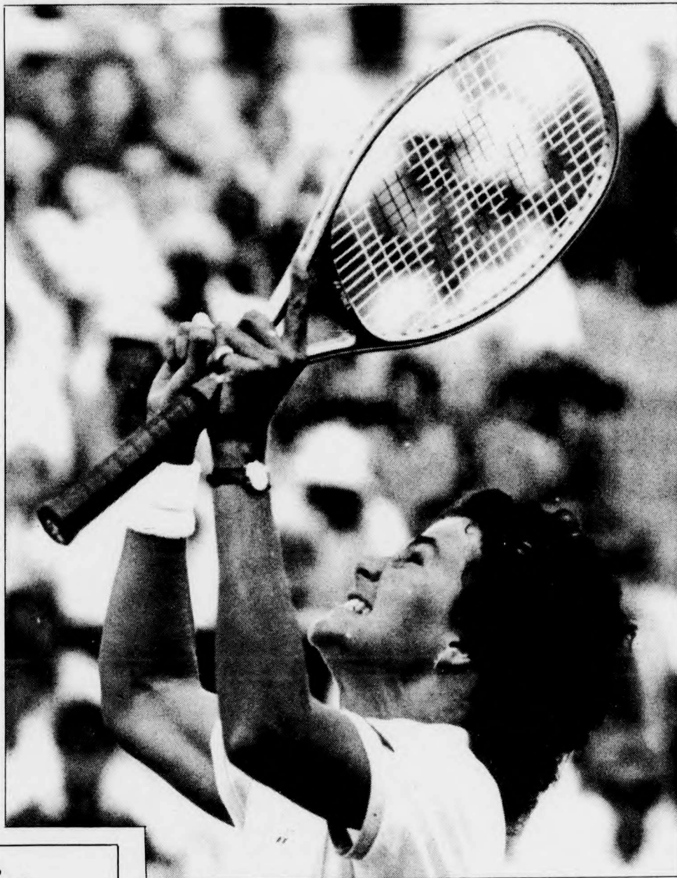
THE THRILL OF VICTORY: Pam Shriver celebrates after defeating Zena Garrison 6-4, 6-1, to capture the Canadian Open at York's National Tennis Centre August 15-23. The Canadian Open was Shriver's biggest singles victory of her career to date.