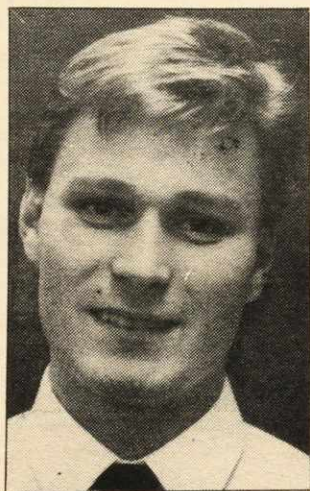
Coca Cola Athlete of the Week

The men, who host number-three ranked nationally Acadia on February 2, will be at Saint Mary's on February 6 and at home to the X-Men on February 9.