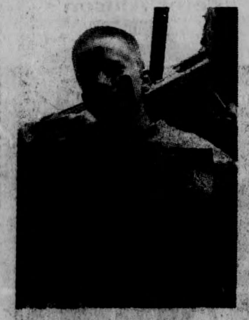
A V-Reds' fan at the CIAU tourna ment cheering on his team.