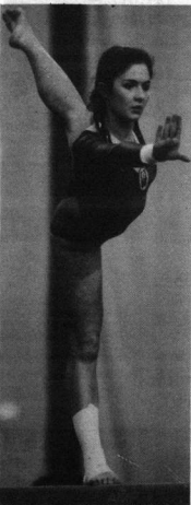
Panda gymnasts national champs