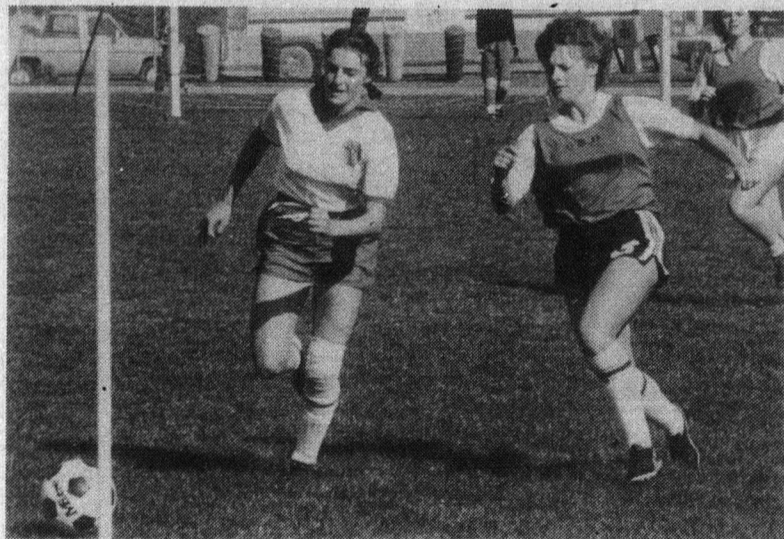
Pandas Soccer: "Improving every week."

The Pandas move into Varsity stadium for their next game against the University of Saskatchewan, October 8.