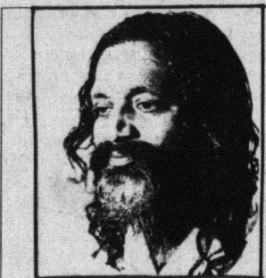
Maharishi Mahesh Yogi founder of Transcendental Meditation and the Science of Creative Intelligence

But Falwell and Campbell insist on equal rights to meddle in the political process. Not in a political way, you understand, but for religious reasons: Trudeau's middle finger is obviously possessed by demons, for instance, and his government is