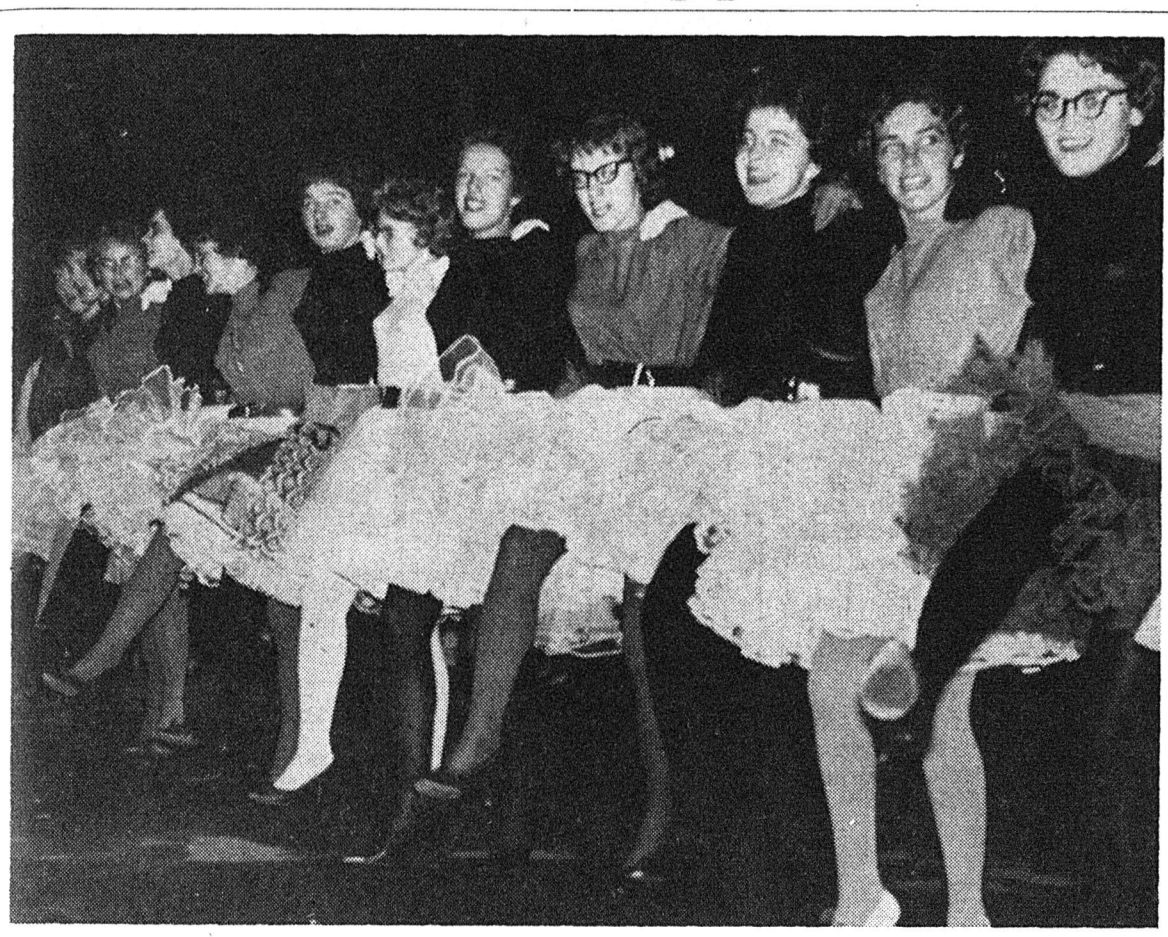
Campus Coeds Kick Off Freshman Introduction Week