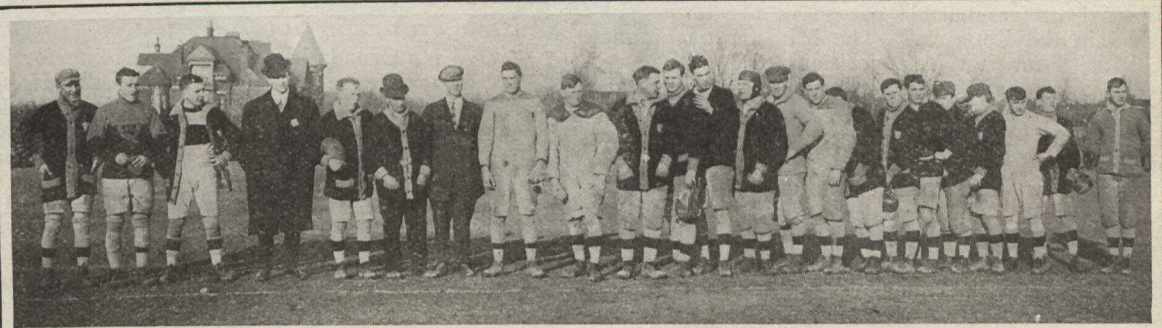
Hamilton Alerts, Senior Team, which won the Dominion Championship on Saturday Last by Defeating Toronto Argonauts.