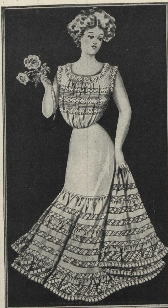
CR1-2203. Women's Skirt , made of good strong Cotton , with extra deep umbrella flounce of lawn trimmed with six rows torchon insertion, finished with deep ruffle of lace; this is a very pretty skirt; dust frill. Sale Price 1.19