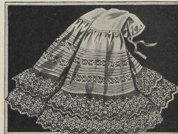
CR1-2208. Women's Skirt , made of good Cotton has deep flounce of good lawn trimmed with three clusters of 1/4-inch tucks, two rows Val. insertion finished below with double frills of wide Val. lace. Sale Price 1.89