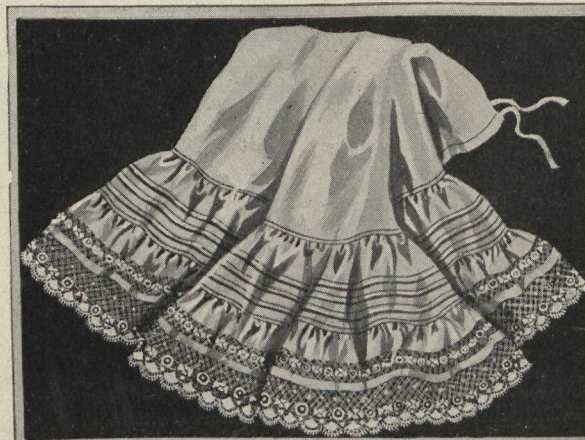
CR1-2201. Women's Skirt , made of good Cotton , French band, deep umbrella flounce of fine lawn; trimmed with three 1/4-inch tucks, lawn frill, one row lace insertion and finished with lace. Sale Price .69