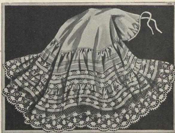
CR1-2209. Women's Skirts , made of good Cotton deep umbrella flounce of fine lawn finished with two clusters of three tucks, two rows Val. insertion, deep frill with two rows of lace insertion and frill of lace, under dust ruffle. Sale Price 1.93