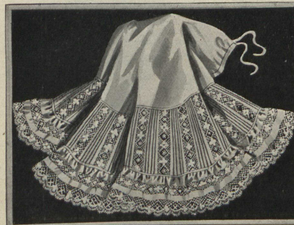
CR1-2204. Women's Skirt , made of soft Nainsook with deep flounce of twenty-eight rows of wide lace insertion running up and down, with tucked lawn between, finished with frill of lawn, lace insertion and lace edging; dust ruffle. Sale Price 1.53