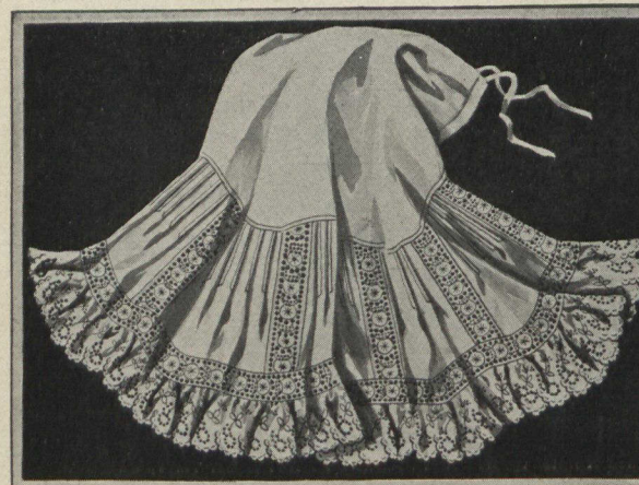
CR1-2207. Women's Skirt , made of good Cotton , deep flounce of lawn with clusters of six tucks between thirteen rows of Swiss insertion, finished with one row Swiss insertion and frill skirting embroidery under dust ruffle. Sale Price 1.83