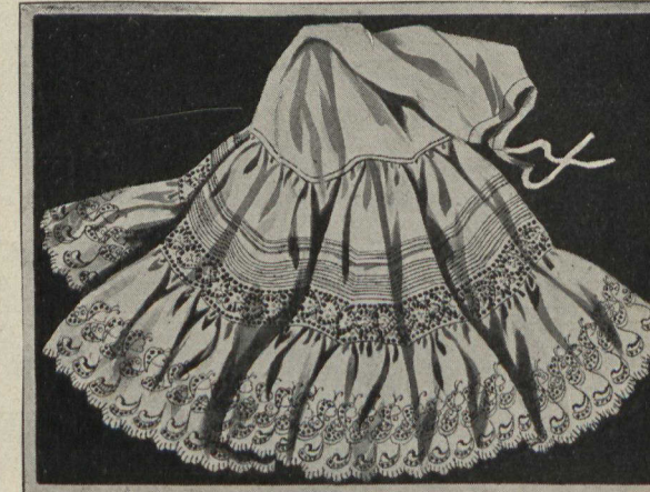
CR1-2210. Women's Skirt , made of good Cotton , deep umbrella flounce of fine lawn trimmed with ten narrow tucks, one row of extra wide fine Swiss insertion, finished with wide flounce of extra fine Swiss skirting embroidery. Sale Price 2.25

Write for January and February Catalogue