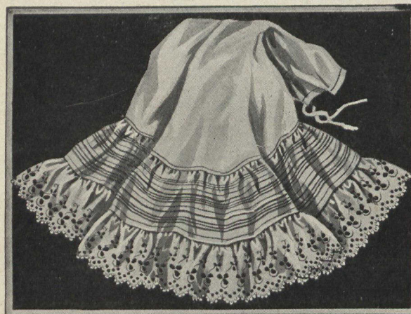
CR1-2202. Women's Skirt , made of good Cotton , deep umbrella flounce of lawn trimmed with 3 clusters of three fine tucks between three 1/4-inch tucks, finished with flounce of good quality of skirting embroidery. Sale Price .99