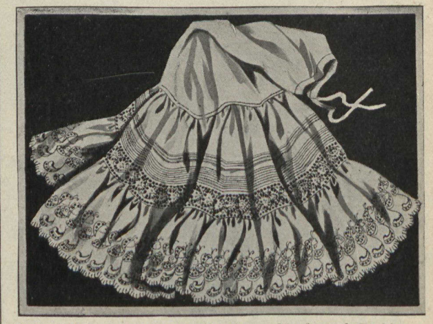
CR1-2210. Women's Skirt, made of good Cotton, deep umbrella flounce of fine lawn trimmed with ten narrow tucks, one row of extra wide fine Swiss insertion, finished with wide flounce of extra fine Swiss skirting embroidery. Sale Price 2.25