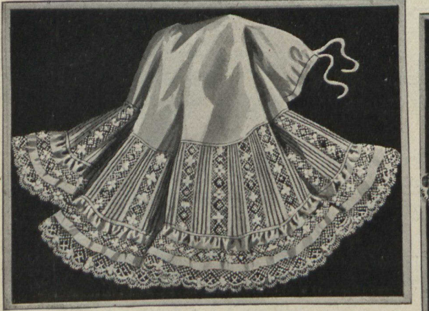
CR1-2204. Women's Skirt, made of soft Nainsook with deep flounce of twenty-eight rows of wide lace insertion running up and down, with tucked lawn between, finished with frill of lawn, lace insertion and lace edging ; dust ruffle. Sale Price 1.53