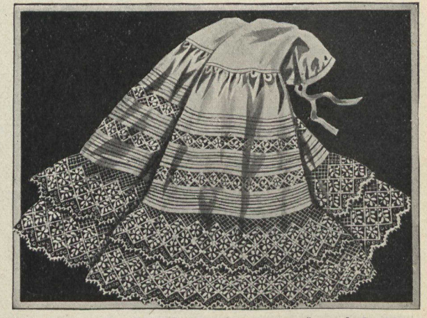
CR1-2208. Women's Skirt, made of good Cotton has deep flounce of good lawn trimmed with three clusters of 4-inch tucks, two rows Val. insertion finished below with double frills of wide Val. lace. Sale Price - - 1.89