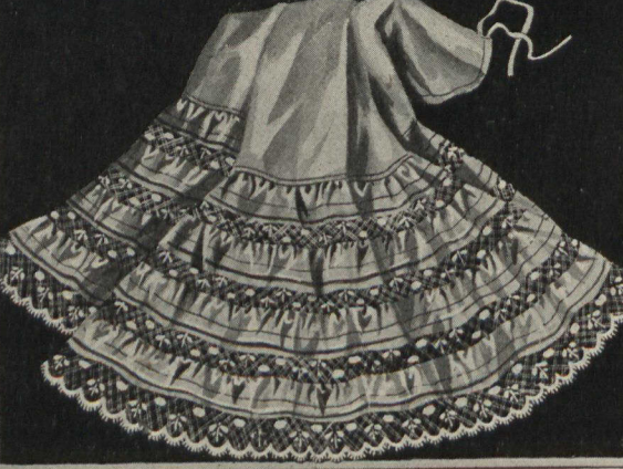
CR1-2205. Women's Skirt, made of good strong Cotton, deep circular floance of fine lawn with four 1-in tucks and three rows of torchon lace insertion between, finished with lace edge, dust ruffle. Sale Price - - - 1.65