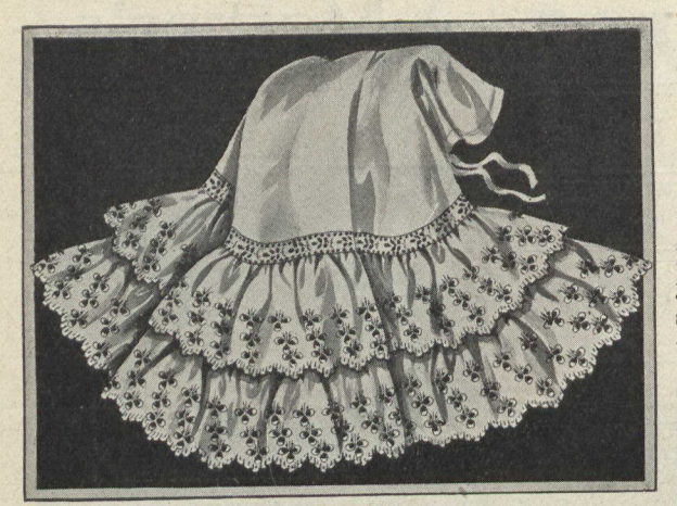
CR1-2206. Women's Skirt, made of good Cotton, handsome double flounces of fine skirting embroidery, finished above with one row Swiss insertion, under dust ruffle. Sale Price 1.73