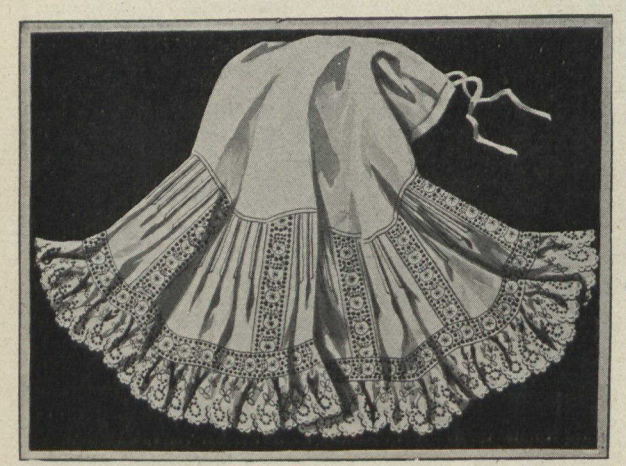
CR1-2207. Women's Skirt, made of good Cotton, deep flounce of lawn with clusters of six tucks between thirteen rows of Swiss insertion, finished with one row Swiss insertion and frill skirting embroidery under dust ruffle. Sale Price 1.83