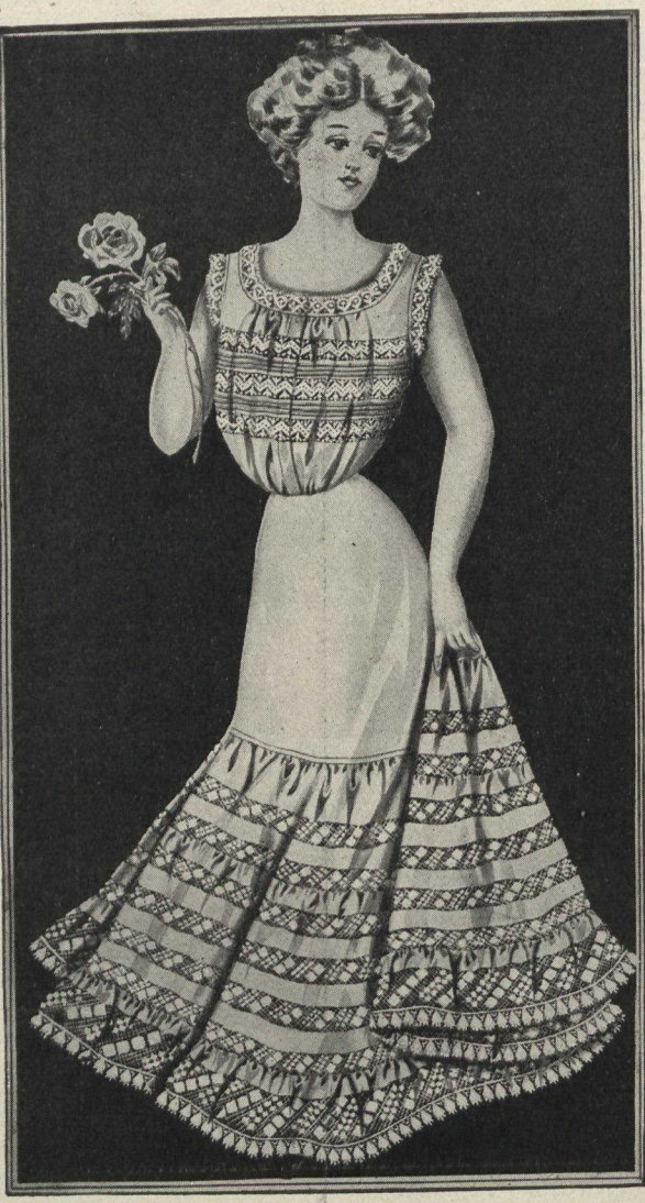
CR1-2203. Women's Skirt, made of good strong Cotton, with extra deep umbrella flounce of lawn trimmed with six rows torchon insertion, finished with deep ruffle of lace; this is a very pretty skirt; dust frill. Sale Price - 1.19

Exact copies of garments showing you in much detail just how they appear on close observance. They'll stand your critical examination and please you in style, wear and price value.