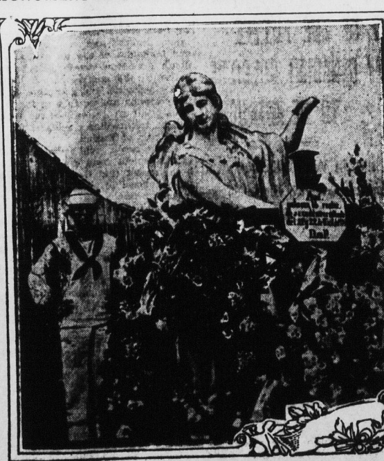
Americans in Vera Crus on April 21, 1914, the day marines were landed for the occupation of the city.