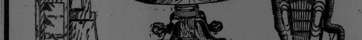
Genuine Quartered Oak Extension Table, 44 inch top, extends to 6 ft., brilliantly golden polished, splendid construction throughout. Heavy pedestal resting on four large claw feet. $21.50