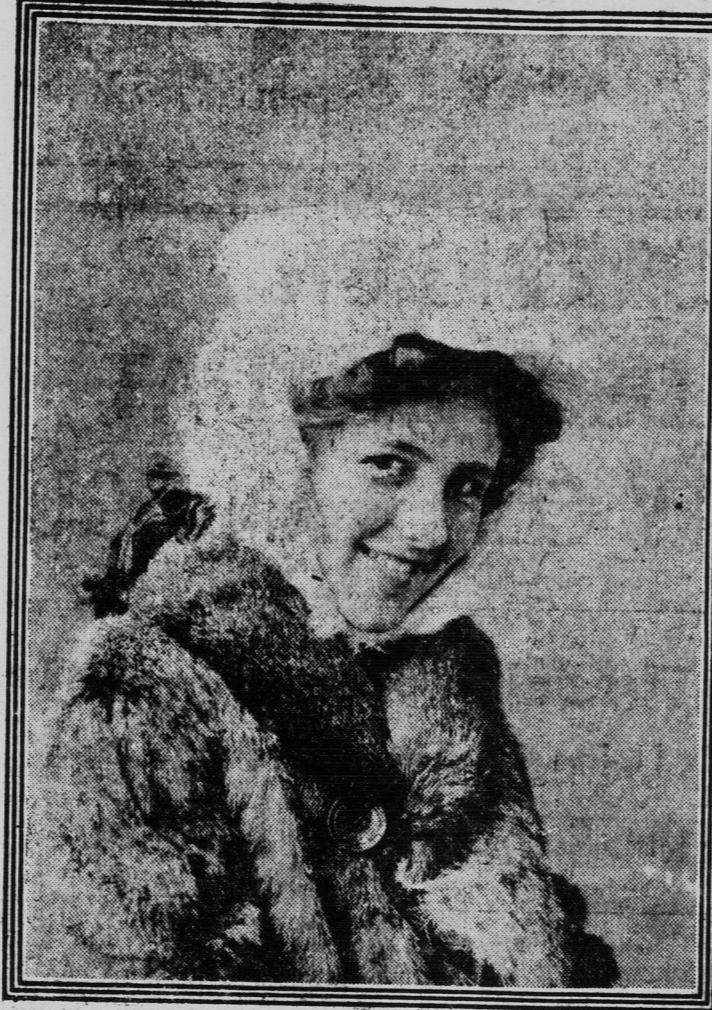
THIS LITTLE GIRL CAME IN A MOTOR. The small maid who motors to dancing class and party there is provided warm coats of the less expensive fur, loose and roomy enough to slip on over the most elaborate frock without crushing...

ONLY A Common Cold, but it becomes a serious matter if neglected. Pneumonia, Bronchitis, Asthma, Catarrh or Consumption is the result.