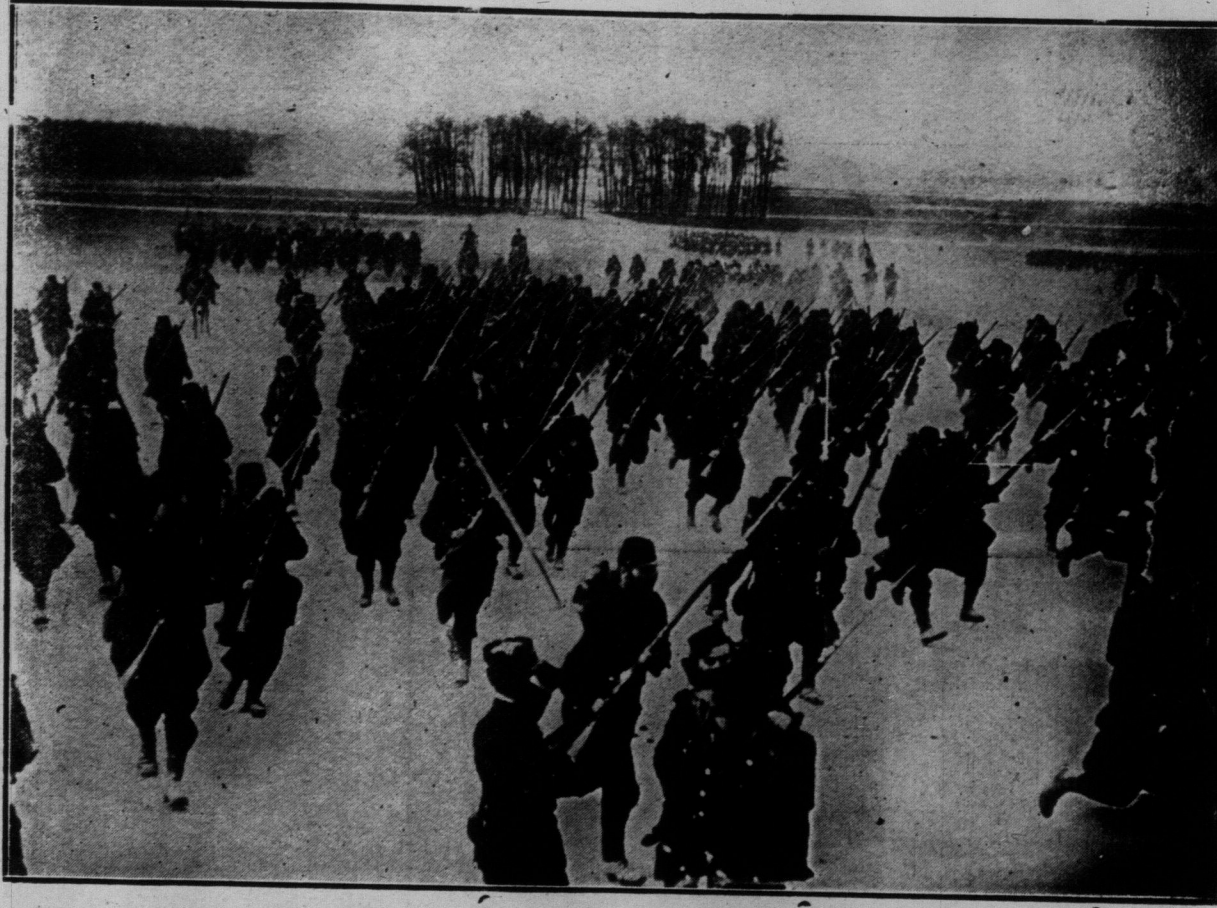
One of the great events of the royal visit to Paris was a grand military review at Vincennes. Three divisions co. 284 of the flower of the French army marched past before their Majesties. At the close of the review the cavalry charged at full speed for a distance of three-quarters of smile, and halted a short distance from the royal stand.