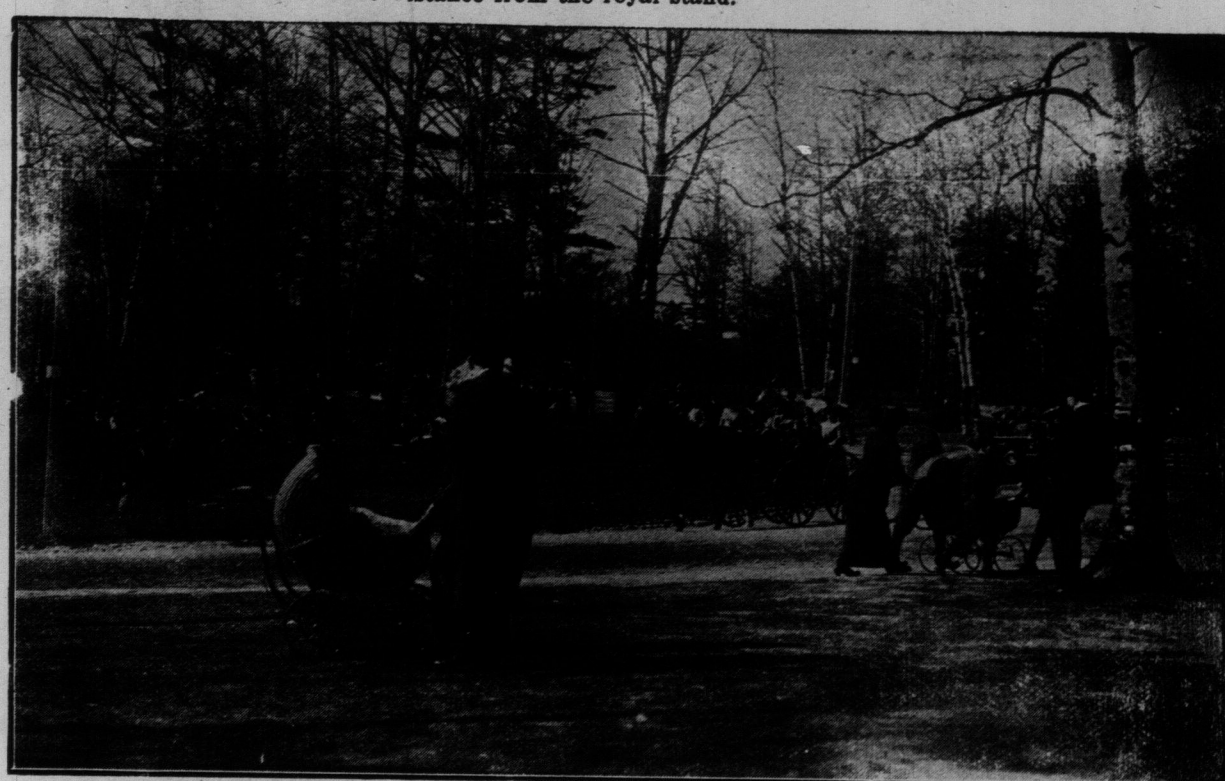
AS THE TREES BEGIN TO SHED SHADE THE CROWDS SWELL IN HIGH PARK. THE PICTURE WAS TAKEN A SUNDAY AGO AND IS A TYPICAL EARLY SUMMER PARK SCENE