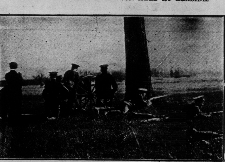
ONE OF THE GREAT DIFFICULTIES DURING THE LEASIDE TACTICAL MANOEUVRES OF THE Q.O.R. AND 48TH HIGHLANDERS WAS TO GET THE MEN TO KEEP UNDER COVER. AND THE OFFICERS WHO PASSED THIS JUDGMENT APPEARED TO BE RIGHT.