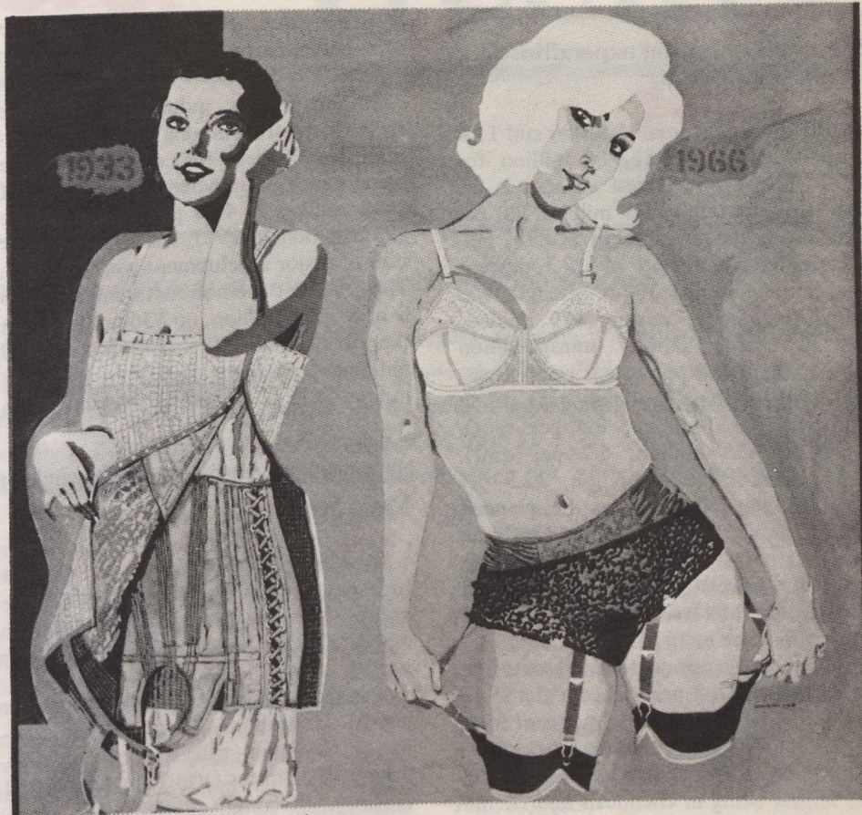
Mothers and Daughters (1966).