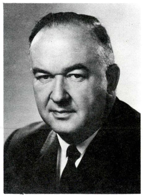
Yvon Beaulne, Canada's representative to the UN Commission on Human Rights.

Yvon Beaulne, Director-General of the Bureau of African and Middle Eastern Affairs in the Department of External Affairs, has been appointed Canada's representative on the United Nations Commission on Human Rights. Canada was elected to the Commission by the fifty-eighth session of the United Nations Economic and Social