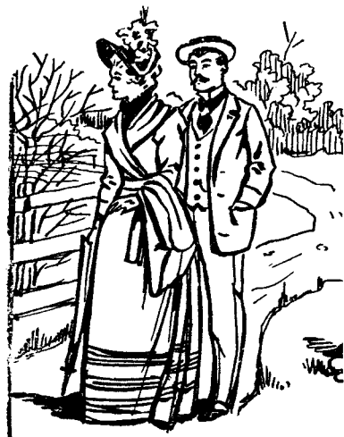
YOU'LL BE SNUBBED.

If your appearance chances to be unwelcome, and it's pretty certain to be so if your appearance isn't what it should be. To appear well and be perfectly secure from the risk of being snubbed, appear in one of our summer suits. You'll look all right then, and you'll be received as you look. Our stock is as full of novelties as summer is of sunshine. See our suits at $10.00.