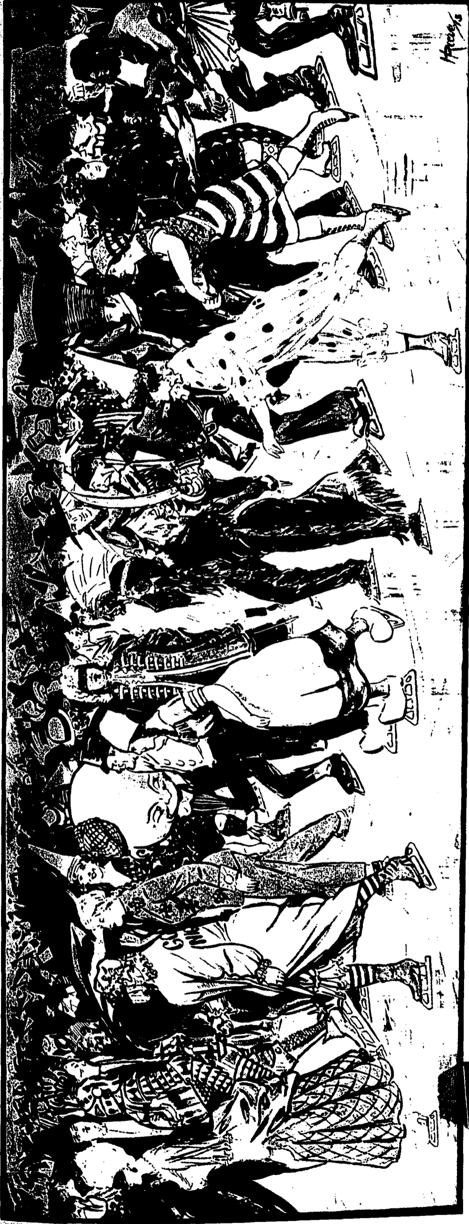
MASQUERADE SKATING CARNIVAL - JANUARY, 1913 - VICTORIA, B. C.