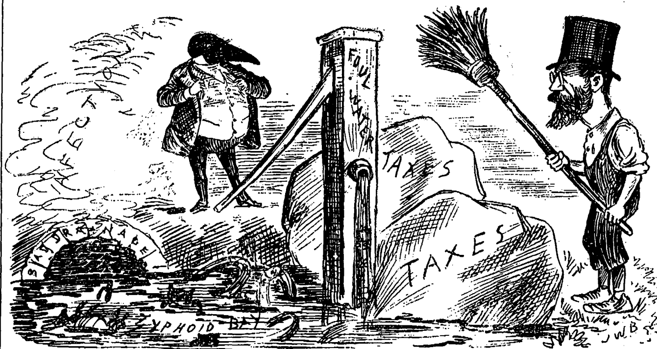
THE NEW BOY.

MR. GRIP.—NOW THEN, MY LAD, HUSTLE AROUND AND GET TO WORK. YOU'VE NO TIME TO LOSE.