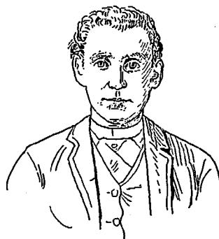
A MONTREAL FAVORITE.

"Oh, where is my wandering boy to-night, My boy with the golden hair?" "He's been out with the boys on a howling tight, And he's under the peeler's care."